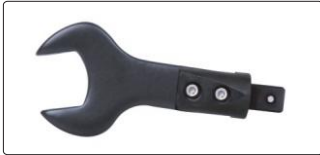
type A (optional)