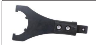
type UM (optional)